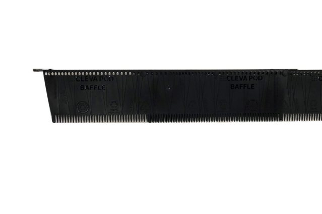
HANDY TIP: Two CLEVA COMB™s can be joined together using the

CLEVA PLUG™s to bridge the full diagonal cut of a CLEVA POD®