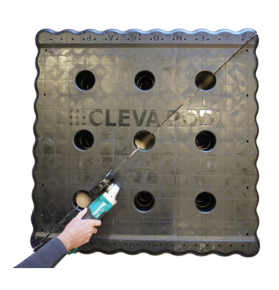
Cut the marked section out from the CLEVA POD®